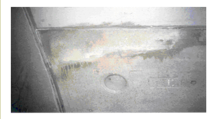
Figure 1. Repaired Concrete Tunnel Section

The government requires strict controls over the construction and maintenance of these structures to insure that they will remain serviceable for 100 years or longer. Therefore, concrete repairs are being monitored to catch deterioration before it becomes a hazard.