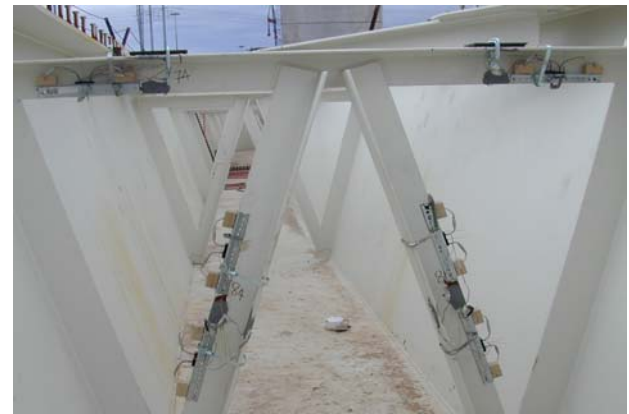
MicroWIS units mounted on K-frame

Sampling at once per 8 minutes or once per 30 minutes (depending on the stage of construction), the units measured the strains induced on the beams by both mechanical loads and diurnal temperature effects. The temperature-induced stresses were used to interpret results of load testing that was performed using weighted trucks after the bridge was completed. During this testing, the MicroWIS units were wirelessly instructed to sample at once per 16 seconds.